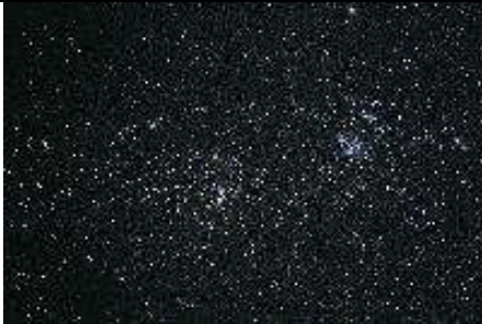
Double Cluster (see page 5)