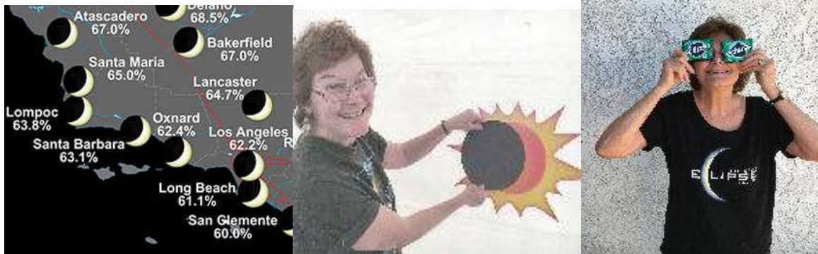
Aug 21 st eclipse % local area Jana @ Madras pin the moon on the sun Filtering the Rays

Image capture was with a Celestron OMNI XLT102 (4 inch) 900 mm focal length refractor and a Canon T3 Rebel (modified) DSLR. Ten Light frames at ISO 1600, 30 seconds per frame and 3 Dark frames were all processed using DSS and PSP 9 software. All images were taken in Unguided configuration.