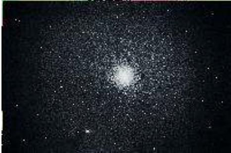
Messier 13 globular cluster (see page 5)